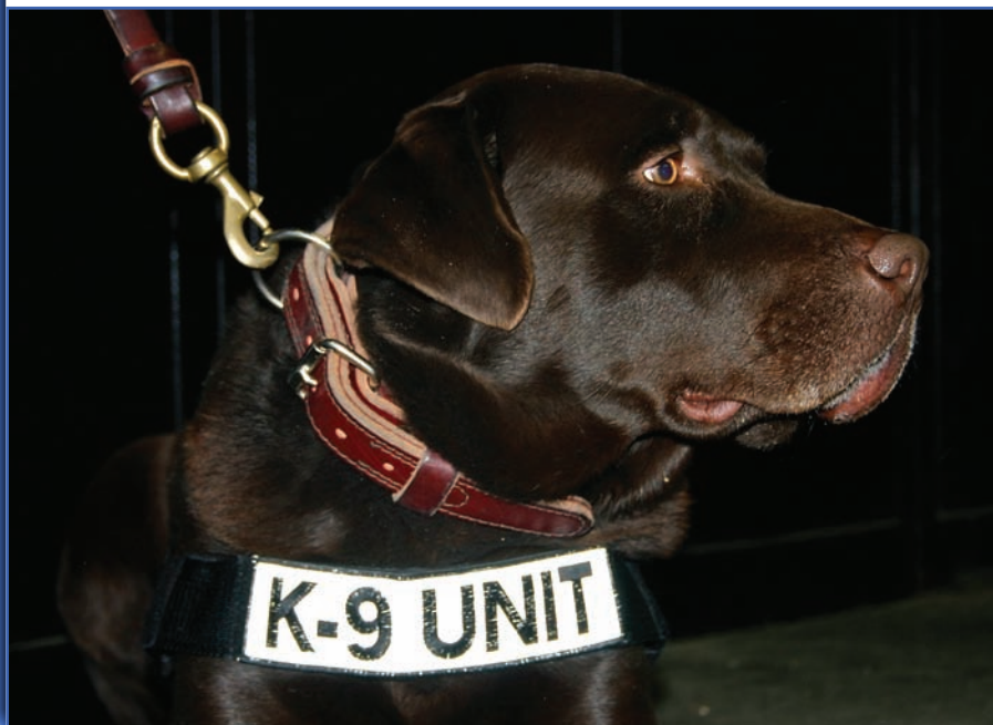
Tacoma, one of the K-9 Unit's EOD/Ballistic Detection K-9s, takes a break after an Odor Recognition training exercise.