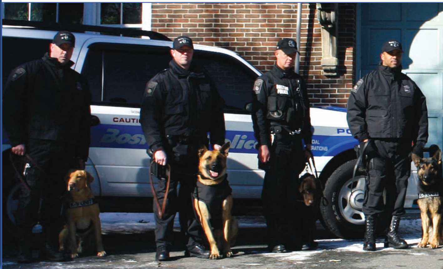
Officers and their dogs from the BPD K-9 Unit.

he knows that in addition to keeping the dogs and the men sharp, they come in handy when the officers must testify in court. Certifications received by Boston K-9 teams include those from the BPD, the International Police Work Dog Association (IPWDA), the United States Police Canine Association (USPCA), the ATF National Odor Recognition Test (NORT) and more. Boston EOD K-9 teams also participate in joint training with the BPD Bomb Squad for IED scenarios.