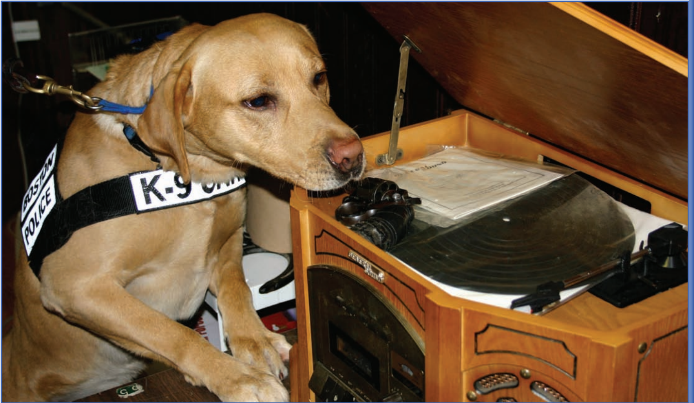
EOD/Ballistic Detection K-9 Lieno discovers a revolver hidden beneath the cover of a turntable.

smiles—“Oh, I learned the hard way, all right.”