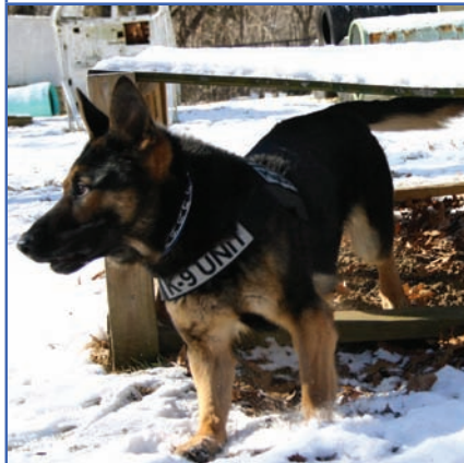
Here, Bronson emerges from beneath a wooden “crawl” structure. (above)