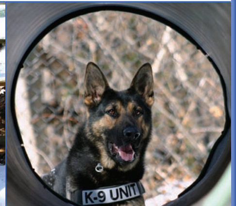
Bronson waits faithfully for his master’s command to navigate this tube. (above)